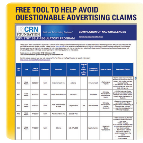
CRN's NAD microsite with a searchable history of case data