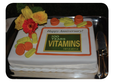
CRN worked with Congressional leaders to get the 100th anniversary of the vitamin milestone entered into the Congressional Record